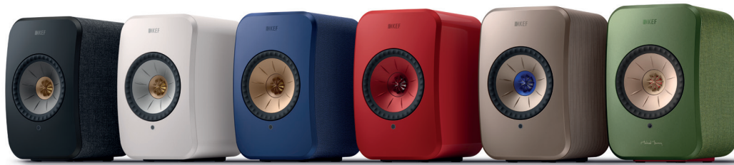
Carbon Black Mineral White Cobalt Blue Lava Red Soundwave by Terence Conran Edition Olive Green