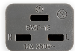
SWF-16 16A C19

Note! The connector must be connected to a wall socket with a ground terminal for the full LoRad effect to take place. LoRad are tested and certified by Intertek Sweden, meeting the European safety regulation HD21.5 S3.