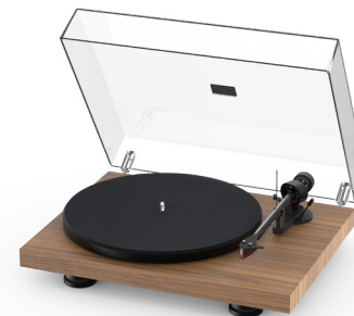
Satin Real-Wood Walnut Veneer