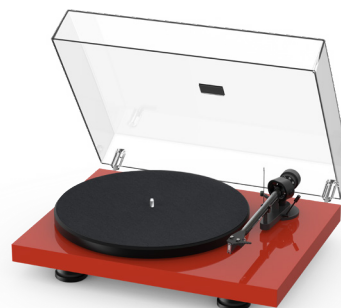
High Gloss Red