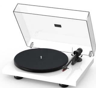
High Gloss White