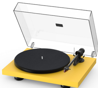
Satin Golden Yellow