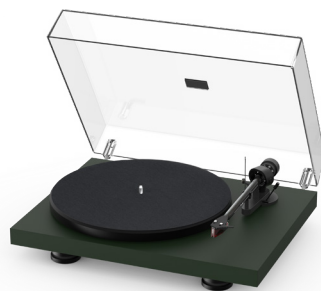
Satin Fir Green