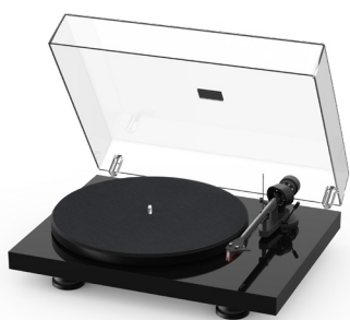
High Gloss Black