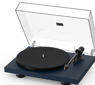
Satin Steel Blue