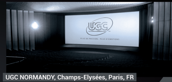
UGC NORMANDY, Champs-Elysées, Paris, FR