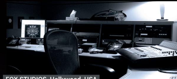
FOX STUDIOS, Hollywood, USA

Film mixing facilities of the original Godzilla movie.