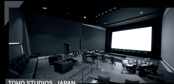
TOHO STUDIOS, JAPAN

Film mixing facilities of the original Godzilla movie.