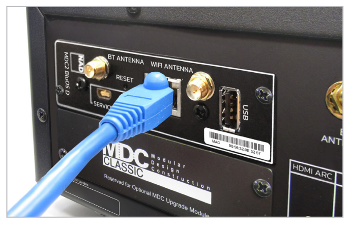
Connect Ethernet cable (not supplied)

*Requires broadband router that supports Ethernet and/or WiFi standards