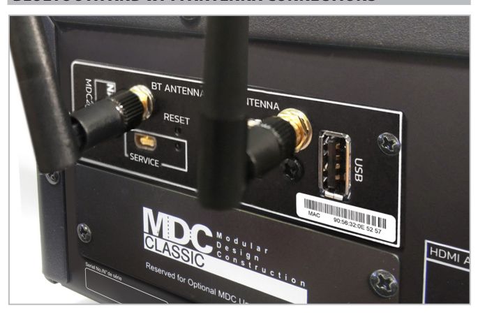
Connect supplied Bluetooth antenna and Wi-Fi antenna*